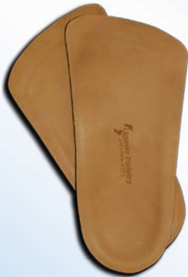
Model 460 3/4 Length Leather Orthotic Insoles