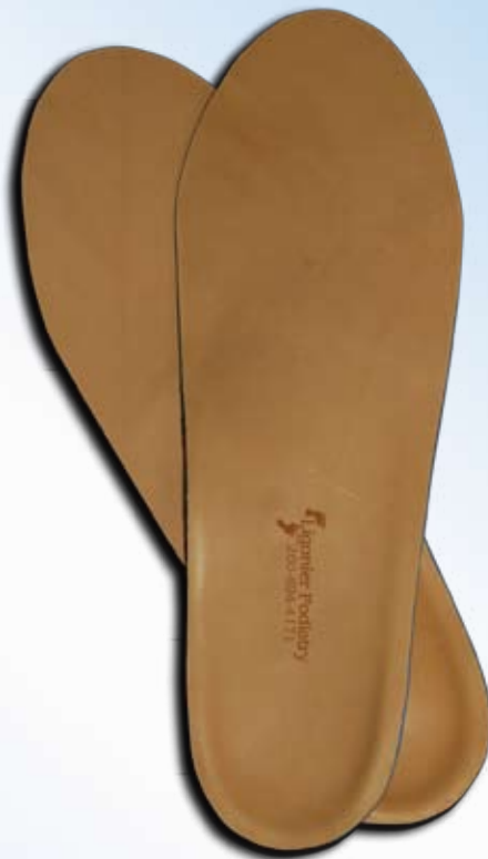
Model 462 Full Length Leather Orthotic Insoles

Customize Right from your Business Card, Letterhead or Graphic Logo Files